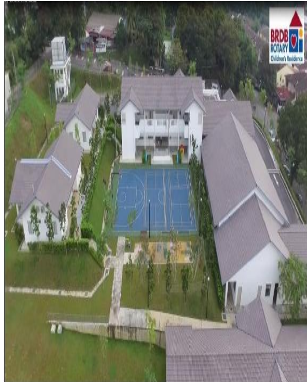
Aerial View of the BRDB -Rotary Children's Residence

The BRDB-ROTARY CHILDREN'S RESIDENCE (BRCR) (JKM Reference No.: B/PJB KK 010/2017) is a safe Home built by ROTARY BRDB TRUST with Registered Trustees (Registration No. PPAB-20/2011), an institution jointly established by The ROTARY CLUB OF KUALA LUMPUR DIRAJA (RCKLDIRAJA) and BANDARAYA DEVELOPMENTS SDN BHD , for Abandoned and Children-in-Need. BRCR is located on a 2.2 acres premises in Seri Kembangan, Selangor, Malaysia. More than just a Home, it is a safe place for young Abandoned and Children-in-Need of ages 3 to 10 years old, to be nurtured and shaped into responsible adults of tomorrow.