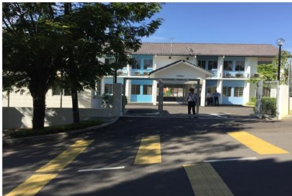
Front View of the BRDB -Rotary Children's Residence